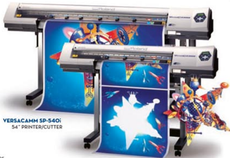
VERSACAMM SP-540i 54" PRINTER/CUTTER