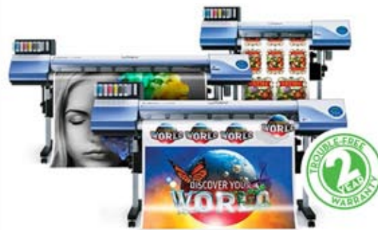
VERSACAMM VS-300i 30" PRINTER/CUTTER