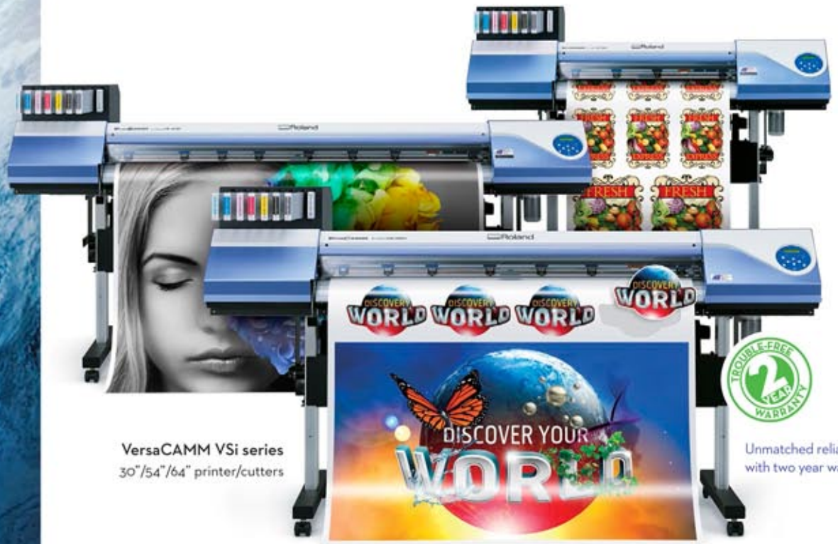
VersaCAMM VSi series 30"/54"/64" printer/cutters